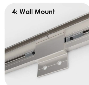
Overall Frame Assembly